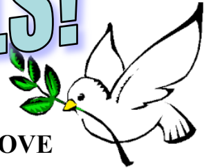
1- THE BEAUTIFUL DOVE