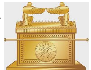
12- THE ARK OF COVENANT- THE MERCY SEAT