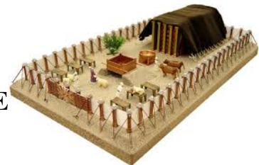
8- THE TABERNACLE OF MEETING (MOSES' DOME)