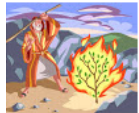
5- THE BURNING BUSH