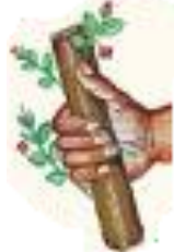
6- AARON'S ROD